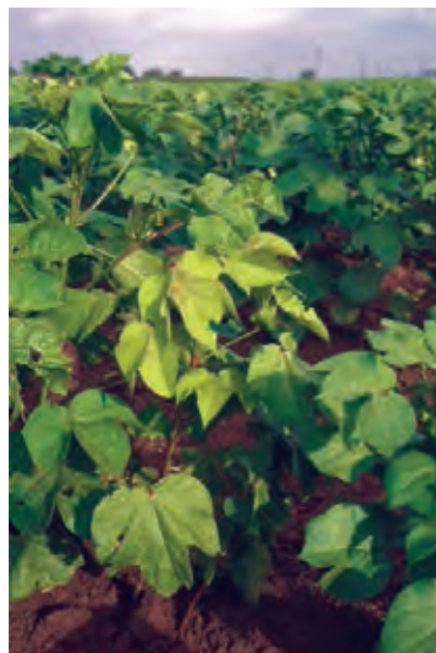
Figure 1. Chlorosis of foliage with bronze wilt.

The cause of bronze wilt is not certain. Both biotic and abiotic factors have been proposed as possible