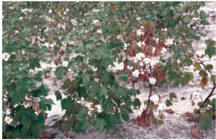
Figures 9 and 10. Stem and foliage necrosis and defoliation associated with bronze wilt.