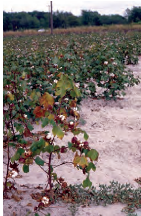
Figure 12. Plants at the end of a row affected by bronze wilt.

Produced by Agricultural Communications, The Texas A&M University System Extension publications can be found on the Web at: http://texaserc.tamu.edu