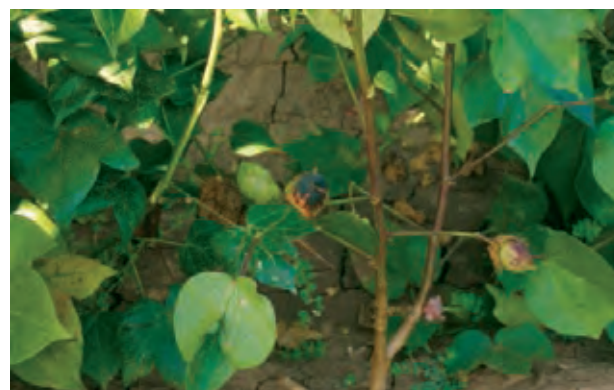
Figures 7 and 8. Bract and boll necrosis with bronze wilt.