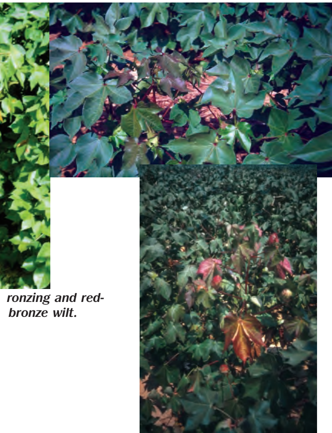
ronzing and red-bronze wilt.