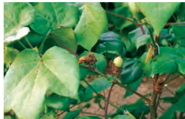
rosis associated with bronze wilt.

causative agents. Brown scars left on taproots from the death of secondary roots are consistently infected with high concentrations of a unique strain of Agrobacterium tumefaciens . However, the bacterium is ubiquitous and can be found in roots and seeds of nearly all cotton plants regardless of symptoms.