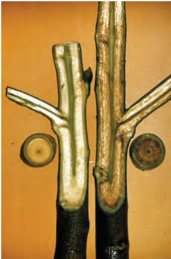
Figure 11. Comparison of lower stem wood in plant with bronze wilt (left) and one with Verticillium wilt (right).