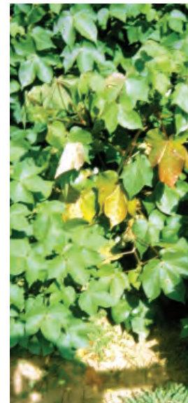
Figures 2, 3 and 4. Dening of foliage with bronze wilt.