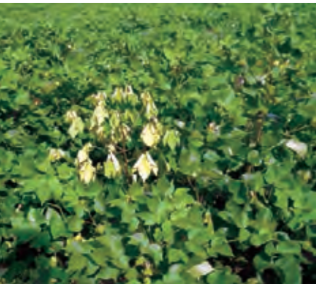
6. Wilt of foliage with bronze wilt.